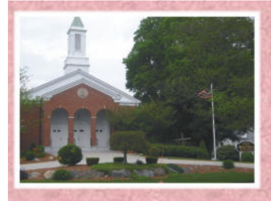
Together in Christ Collaborative