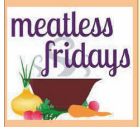
Sick of the same meatless meals? Try out some of these tasty <u>Lent Recipes</u> to mix up your palate while respecting the Lenten sacrifice each Friday!