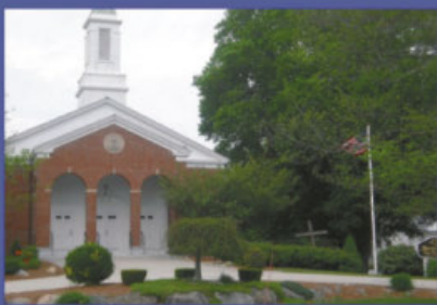
Saint John 's