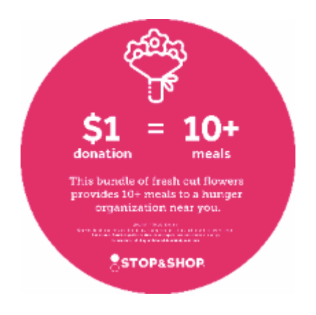
Look for the bouquets with the red circle sticker pictured here to make sure it is a Bloomin' 4 Good Bouquet that will benefit your organization upon purchase

For the month of December 2021, Society of St. Vincent de Paul Saint John's Conference has been selected to receive a $1 donation for every $10.99 Bloomin' 4 Good Bouquet with the red circle sticker (pictured below) sold at the store located at 475 Bedford Street, Whitman MA.