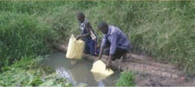
COLLECTING WATER FROM THE SWAMPS