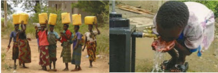
CARRYING THE WATER BACK TO THE PARISH

THE ULTIMATE GOAL IS TO HAVE SANITIZED WATER AVAILABLE AT THE PARISH AND VILLAGE.