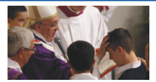
Confirmation Class with 'Certificate of Completion

This exciting course helps prepare the catechumen for the Sacrament of Confirmation. Students will find the videos easy to understand, with clear, concise, and helpful explanations of important concepts.