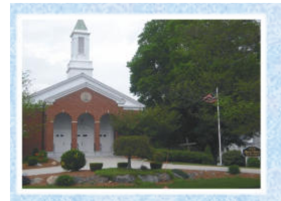
Together in Christ Collaborative