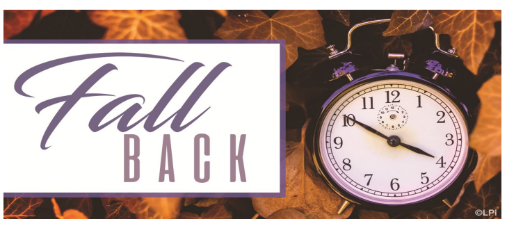
SUNDAY, NOVEMBER 4TH.

SAINT JOHN'S — WILL BE HOSTING THE MIDNIGHT MASS THIS YEAR.